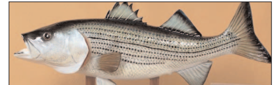
36" fiberglass striped bass wall mount donated by Eagle Enterprises www.keneagle.com